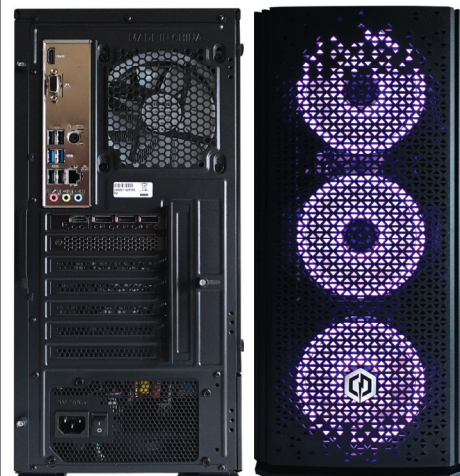
LEFT The Blaze Gaming case is well built, with three RGB fans adding colour

Storage expansion is similarly limited, with the single M.2 slot already occupied. Cyberpower opts for Kingston's budget Gen4 offering,